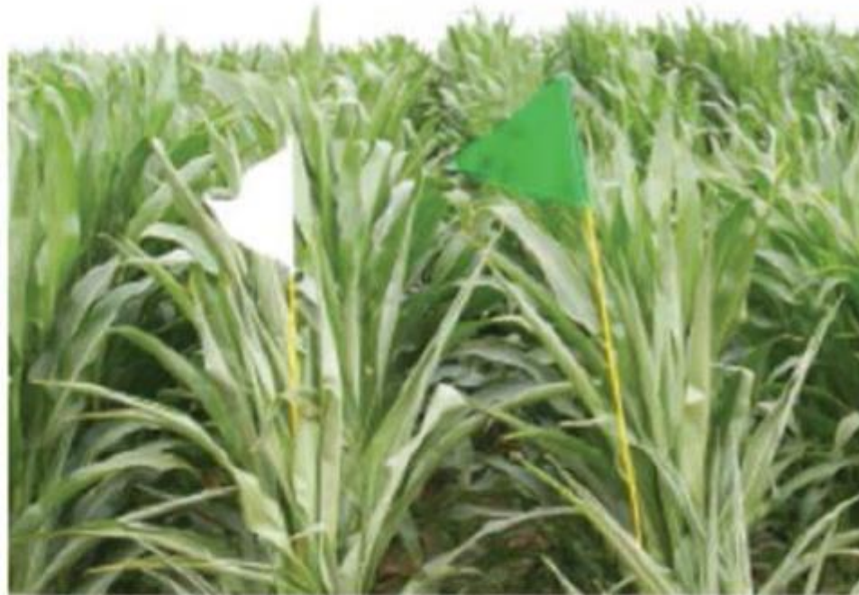
Corn field with glyphosate (white) and glufosinate (bright green) stacked technology

BRIGHT YELLOW is the color chosen for Clearfield® rice technology and STS® soybeans.